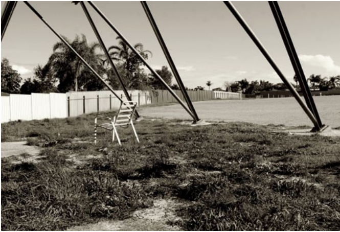
Rhiannon Tully Galaxy Drive-in under the Screen from the series Echo Chambers (2012)