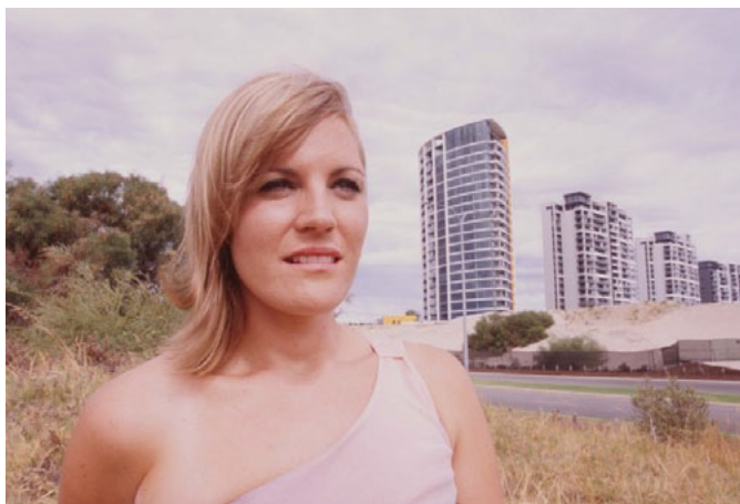
Andrew Botfield Aurora residential complex, north-western viewpoint (2011) Courtesy the artist