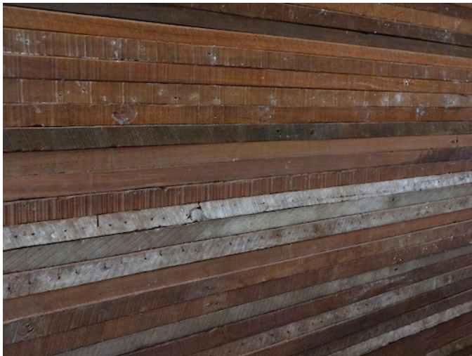
Sebastian Befumo: Cube (detail), chipboard, pine, screws, permanent marker, oak dowel, acrylic paint, clamps, jarrah and sawdust. Dimensions: 2000mm x 2000mm. April, 2014

Exhibition runs from: 11 th – 27 th April Gallery hours: Wed – Sat, 11am – 4pm Closing event: 25 April, 6:30pm